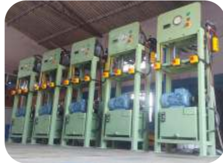
Rubber And Tennis Ball