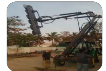
Hydraulic Crunning Machine