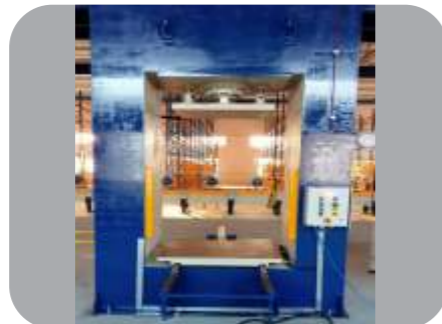
H -type 100 Ton Capacity