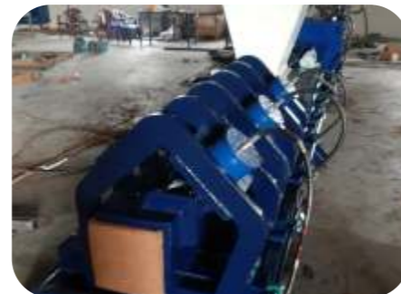
5 Kg Coir Pitch Block