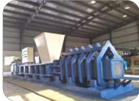
5kg Coir Block