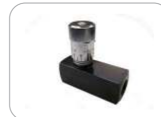
Flow Control Valves