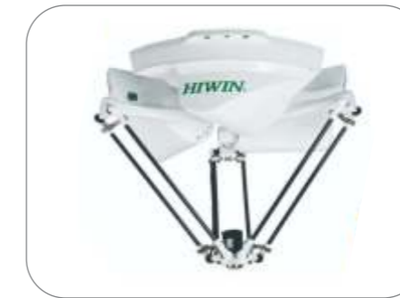
Delta Pick & Place