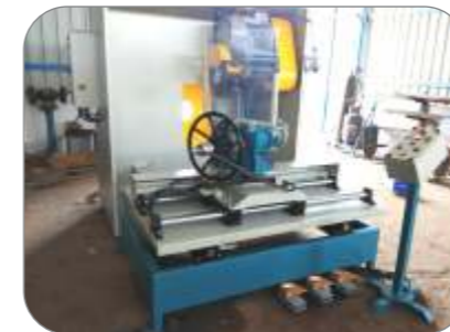
Runner Cutting machine