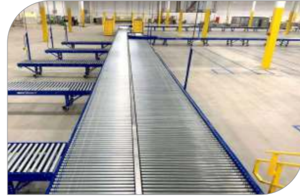
Roller & Belt Conveyors