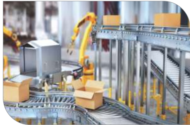
Pick & Place