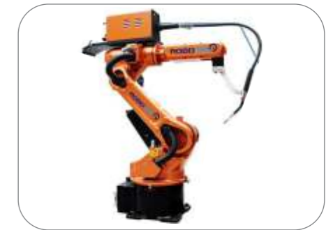
Articulated Welding Robot