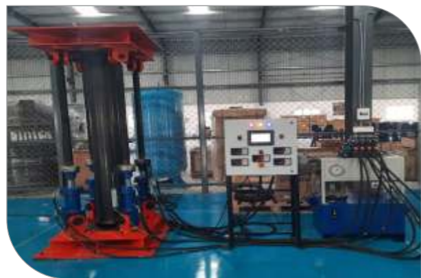
Load Test Aero Space