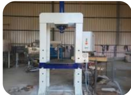
5 Ton H Type Press