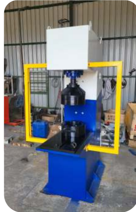
20 Ton Capacity C Type Machine's