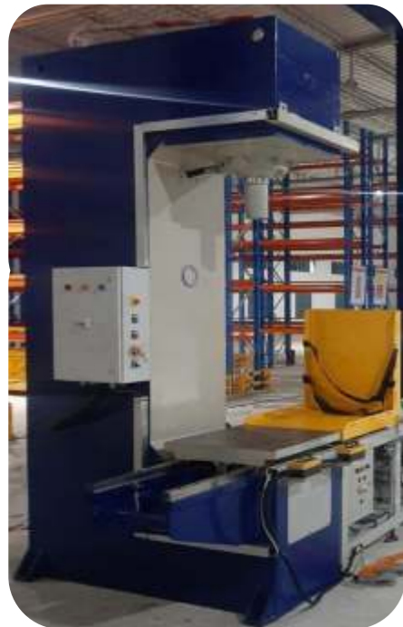
C Type 50 Ton Hydraulic Press