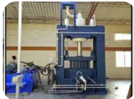
40 Ton Press