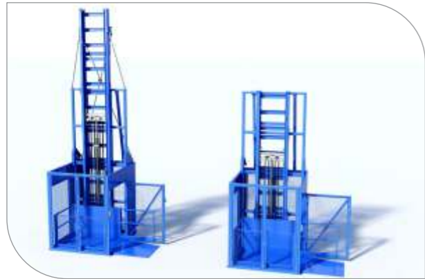
Goods Lift System